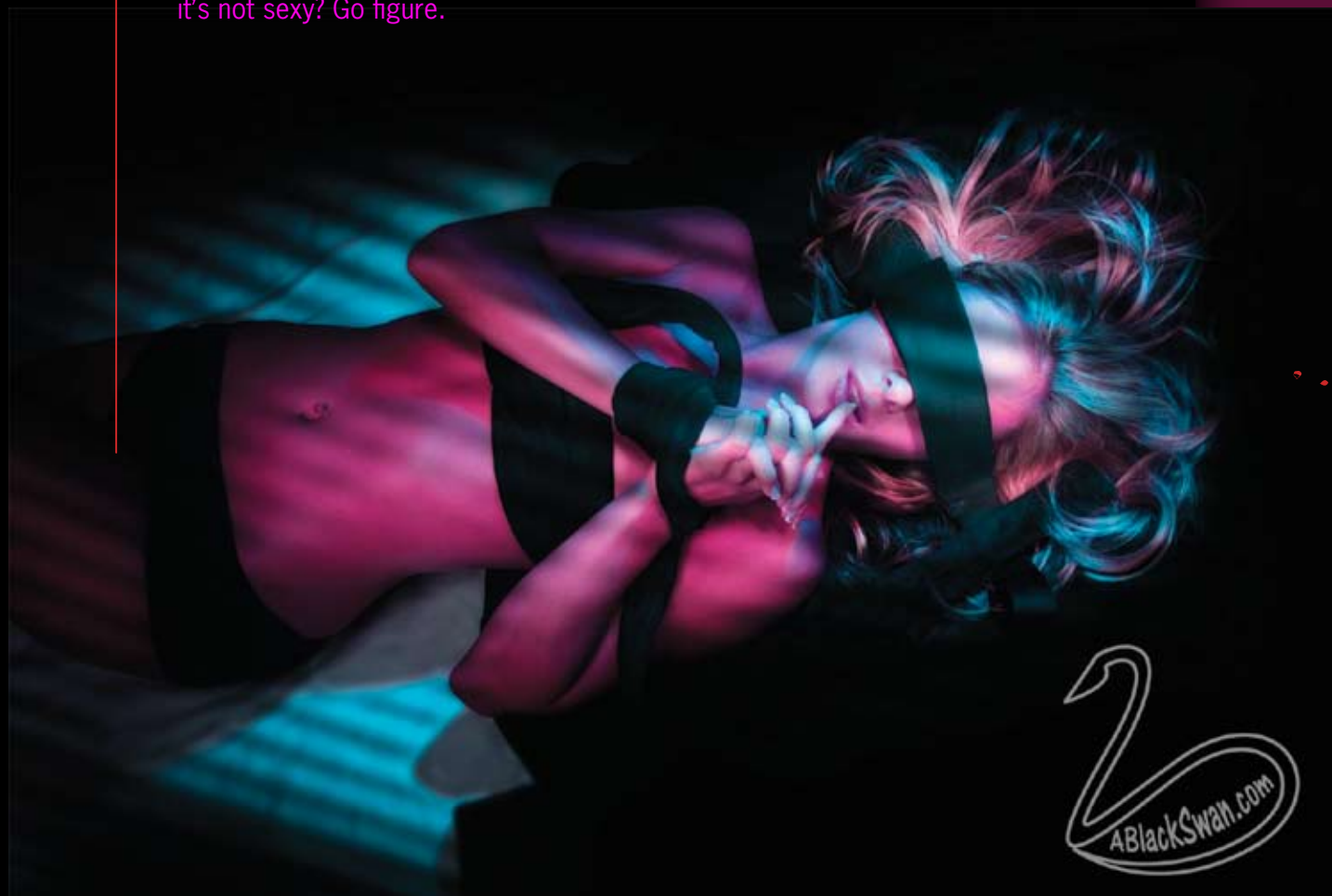
Waiting in a Secret Place

Others are simply interesting, such as Skin . On first glance, this image could be an ad for bathsoap. And yet, what on earth could be sexier than bare skin? How have we been made to buy the idea that if it’s not T & A, it’s not sexy? Go figure.