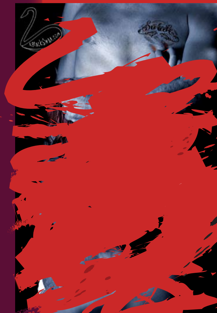
Symbols and Hands (concealed)

Perhaps the most intriguing image is Waiting in a Secret Place . Because it’s simply hard to imagine any piece of male-concept pornography based around the act of waiting. The figure asks us to stay quiet, to keep her secret: she’s waiting for her lover. What’s most sexy about the image is the fact that sex is about to occur . What a concept. In this image, there’s nothing but anticipation in its purest form, creating a kind of paralysis, imagined both literally and figuratively in this photograph.